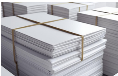
OFFICE PRINTING PAPERS