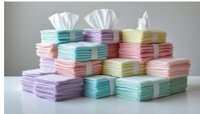
FACIAL TISSUES/ TISSUE PAPERS