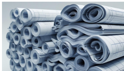
BLUE PRINT PAPER