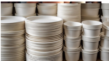
PAPER PLATES/ CUPS/BOWLS